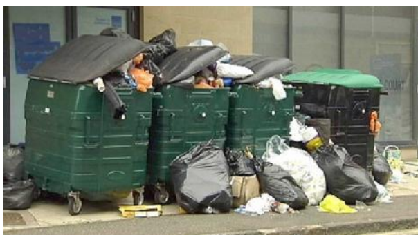
Cowgate – trade waste + fly tipping.