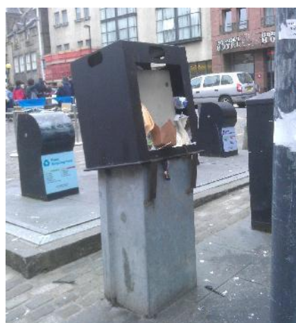
Grassmarket- Rising bin controller broken and used as a bin.