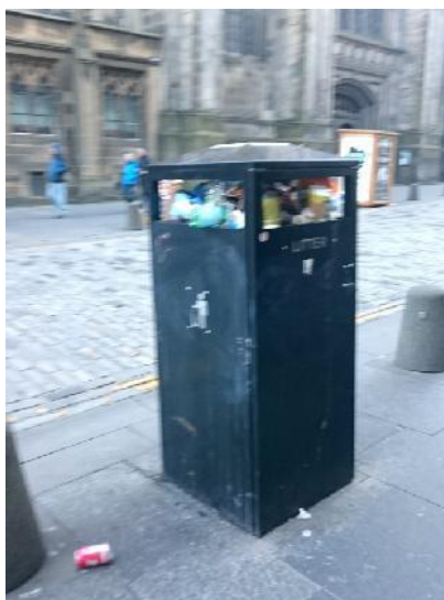
Sunday morning in July Outside City Chambers - "I'm a bin – Nobody cares"